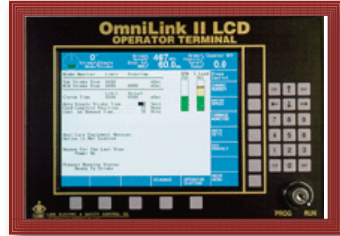
Photo of similar operator interface terminal

Link Black Max Die Space Guard Front and Rear